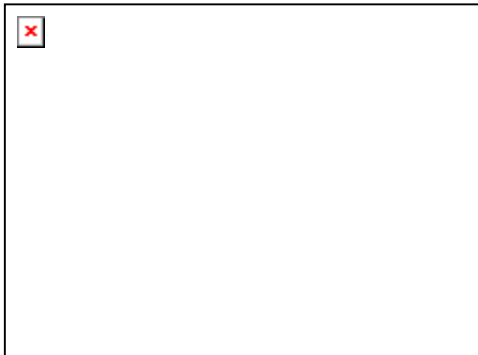
Figure 1. Nitrotyrosine antibody specificity. Competition for nitrotyrosine (NT) antibody (Ab) binding to a NT containing 13mer peptide coated on a plate. ELISA competitors are free nitrotyrosine (◆), NT containing 33mer peptide (●□, chlorotyrosine (■□, and tyrosine (□□). Competition for Ab binding was most effective with free NT followed closely by the NT containing 33mer peptide. This shows that the Ab will recognize free NT as well as NT containing proteins in biological fluids. Significant competition by tyrosine and modified tyrosine occurred at greater than two orders of magnitude higher concentrations of each, indicating very good NT Ab specificity.